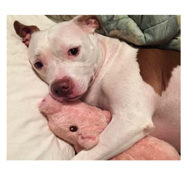
Prichard, No. PD-0712-16

"Is a 'deadly weapon' finding appropriate when the only thing injured or killed is a pit bull rather than a human being?"