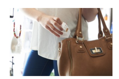
Lang v. State, 561 S.W.3d 174 (Tex. Crim. App. 2018):

"In view of the ambiguous statutory language and the relevant legislative history, we conclude that the organized retail theft statute was not intended to target the conduct of ordinary shoplifters acting alone, such as appellant, and instead requires proof of some activity that is distinct from the act of theft itself."